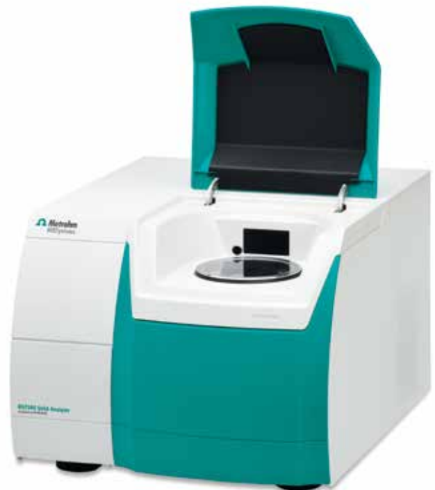
DS2500 Solid Analyzer