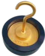
NIRS mini sample cup with the NIRS diffuse gold reflector