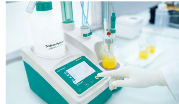
→ Enter the sample data and start the titration