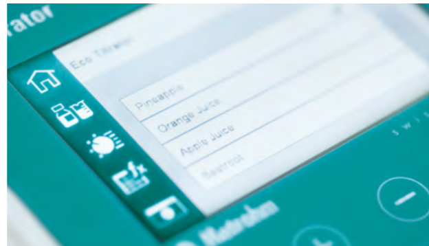
→ Select method

Once your applications are saved on the device, working with the Eco Titrator could not be any easier: Press a few keys and what you get is an accurate, reproducible result for your sample. Depending on your requirements, save a GLP compliant report as a PDF file or send it to printer.