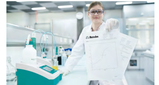
→ Obtain a GLP compliant report