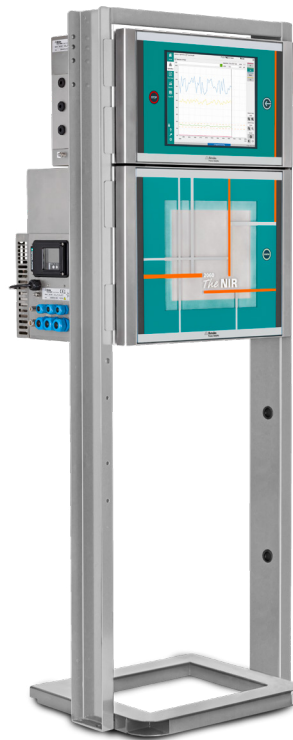
2060 The NIR-Ex Analyzer

At Metrohm Process Analytics, our qualified engineers advise you about the best analysis method and sampling practice during the consultation. After visiting the sampling point(s), an overview of the project will be transmitted together with a commercial offer.