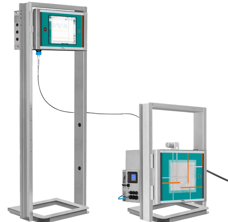
2060 The NIR-REx Analyzer