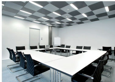
Seminar room 1