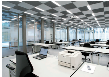
Service instruction room