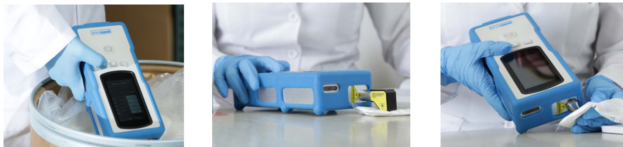
Figure 1. NanoRam in action for raw material identification

Raman technology is known for its fast speed and convenience for material identification and verification. Raman measurements can be conducted through transparent containers without any sample preparation, as shown in the photos of the NanoRam for raw material identification in Figure 1.