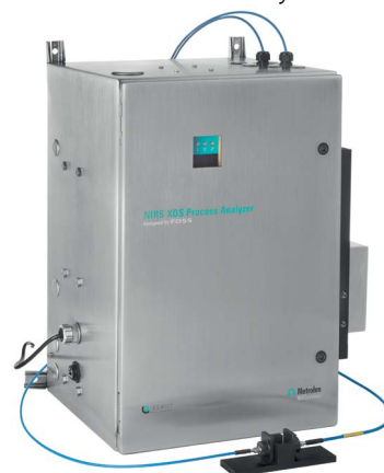
NIR XDS Process Analyzer