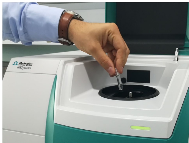
Figure 1. DS2500 Liquid Analyzer and a diesel exhaust fluid sample filled in a disposable vial.